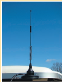
External antenna (included) connects to the modem to maximize cellular service